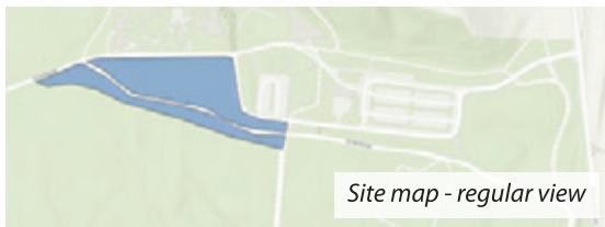
Site map - regular view

mix. The Listen Garden will also feature several "Habitat beds" that highlight Alberta's diverse ecosystems. Beds on the garden's west side will showcase alpine/montane, foothills parkland, and Foothills rough fescue grassland ecosystems, merging into the dry mixed grass and badlands ecosystems on the east side of the gardens. These more "formal" gardens will be installed in a few years. Right now, the space consists of contoured pathways – what isn't currently path will be a home for thousands of tiny native plant seedlings.