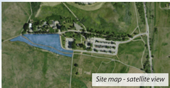
Site map - satellite view

And this year, we've got a special purpose for all those seeds we're harvesting – putting them into the Listen Garden at Bow Valley Ranch – a space for native plants, Indigenous knowledge, and reconciliation. This area has been treated with herbicide to remove the invasive species that cover much of the park and prepare it for the cover crop (annual Plains coreopsis) and native seed mix we'll apply in spring. After one to two seasons, the Plains coreopsis will die, and the high-diversity native seed mix will emerge from below. To speed revegetation along, hundreds of large, salvaged mature plants like Foothills rough fescue, Parry's oatgrass, and Western porcupine grass will be planted in the spring alongside the seed