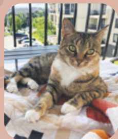
Willow, McKenzie Towne

To have your pet featured, email news@mycalgary.com