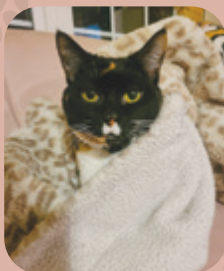
Icy, North Glenmore Park