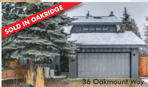
36 Oakmount Way