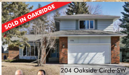
204 Oakside Circle SW