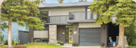
60 Palis Way SW | $799,900

Ready to elevate your lifestyle? Look no further! Nestled on one of Palliser's best streets with a huge south rear yard, double garage + a single, 4 bdrms, 2 upper balconies and an amazing living room providing the perfect space to unwind at the end of the day. Ideal for a growing family. Turn your dreams into reality & contact us for your private viewing.