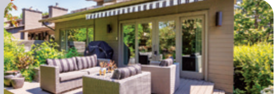
#5 - 68 Baycrest Place SW | $1,299,900

Ready to elevate your lifestyle? Look no further! Nestled on one of Palliser's best streets with a huge south rear yard, double garage + a single, 4 bdrms, 2 upper balconies and an amazing living room providing the perfect space to unwind at the end of the day. Ideal for a growing family. Turn your dreams into reality & contact us for your private viewing.