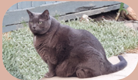
Big Earl, Capitol Hill