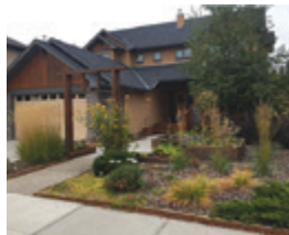
This attractive front yard in SW Calgary proves that with purposeful planning, you can create a functional and beautiful vegetable garden right in the middle of your street.

When well-designed and well-tended, a vegetable garden can be attractive enough to serve as a focal point of the landscape. The key is providing structure for the layout. Remember that fruit trees, bushes, and herbs all combine to create ‘stories’ in the garden. Plant colourful vegetable varieties, flowering shrubs, striking perennials, spring bulbs, and ornamental grasses for year-round interest. Consider leaving a strip of grass along the sidewalk to blend into adjoining yards.... and to keep the veggie snatchers at bay!