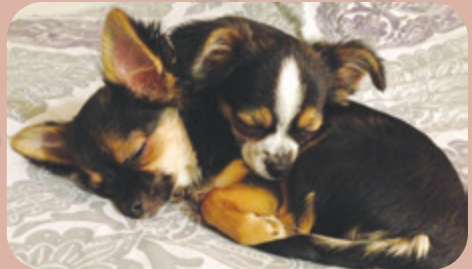
Tiger and Lily, Evanston

To have your pet featured, email news@mycalgary.com