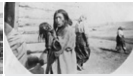
https://digitalcollections.ucalgary.ca/asset-management/2R3BF1FTU1LG?WS=SearchResults . "Blood woman at the ration house, Blood reserve," 1897, (CU1156926) by Unknown. Courtesy of Glenbow Library and Archives Collection, Libraries and Cultural Resources Digital Collections, University of Calgary.