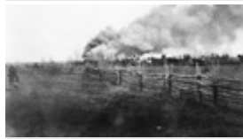
https://digitalcollections.ucalgary.ca/asset-management/2R3BF1O7TXV9?WS=SearchResults . "Start of the battle of Batoche, Saskatchewan," 1885, (CU198943) by Peters, James. Courtesy of Glenbow Library and Archives Collection, Libraries and Cultural Resources Digital Collections, University of Calgary.