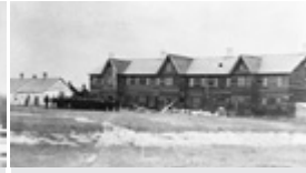
"North-West Mounted Police barracks, Calgary, Alberta," 1888-12-20