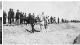
https://digitalcollections.ucalgary.ca/asset-management/2R3BF1X2IA6W?WS=SearchResults . "Canadian Pacific Railway construction on the prairies," 1883, (CU1229514) by Unknown. Courtesy of Glenbow Library and Archives Collection, Libraries and Cultural Resources Digital Collections, University of Calgary.