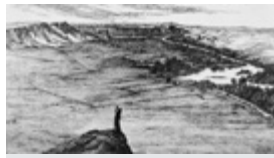
https://digitalcollections.ucalgary.ca/asset-management/2R3BF1OY2G50?WS=SearchResults . "Blackfoot crossing, Bow River, Alberta," 1882, (CU181390) by Unknown. Courtesy of Glenbow Library and Archives Collection, Libraries and Cultural Resources Digital Collections, University of Calgary.

*All copyright images cannot be shared without prior permission.