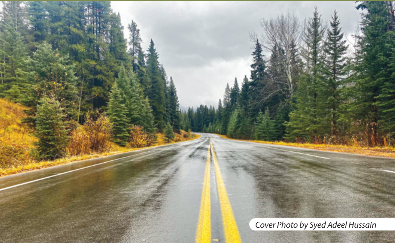
Cover Photo by Syed Adeel Hussain