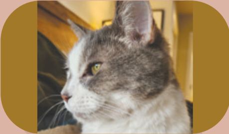
Squeeks, Mount Pleasant