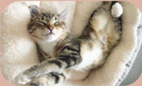
Ravioli, Lower Mount Royal