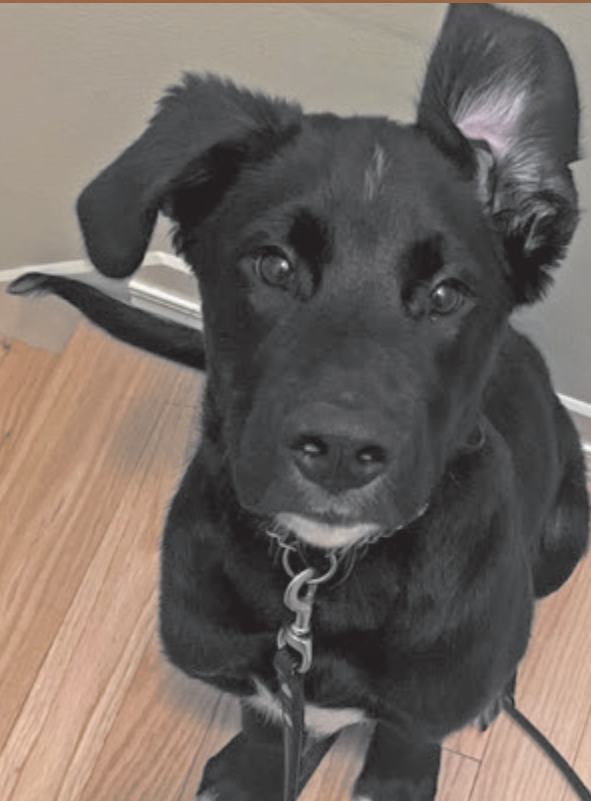
Potter by Sky