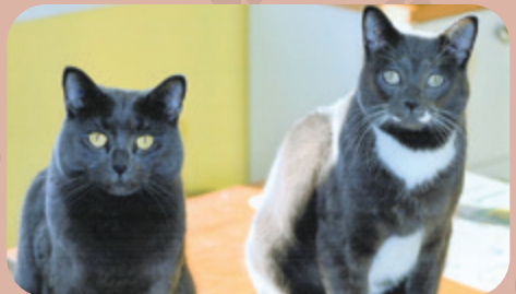
Sir Gawain and Sir Tristan, Woodbine

To have your pet featured, email news@mycalgary.com