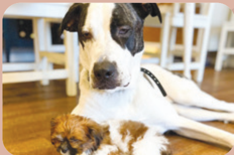
Teddy and Sassy, Foothills