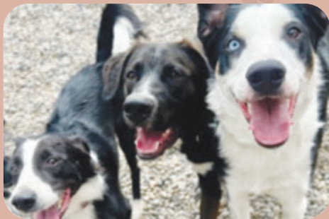
Bowser, Remus, Riku, Montgomery