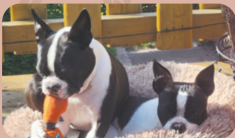
Thor and Loki, Shawnessy