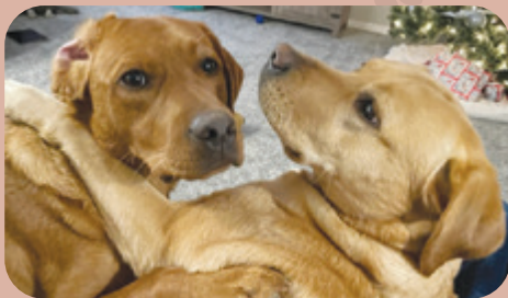
Lake and London, Cranston