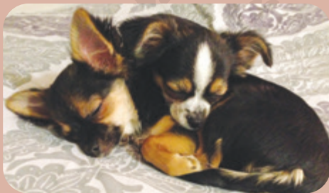
Tiger and Lily, Evanston

To have your pet featured, email news@mycalgary.com