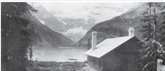
"The first Lake Louise Chalet, Lake Louise, Alberta," [ca. 1890-1893], (CU185533)