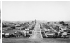
"Bridgeland area, Calgary, Alberta., [ca. 1912-1915], (CU140825) by Unknown. https://digitalcollections.ucalgary.ca/asset-management/2R3BF11WVC9?WS=SearchResults.