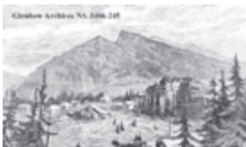
"Canadian Pacific Railway hotel, Banff, Alberta," 1888, (CU181509) by Unknown. Courtesy of Glenbow Library and Archives Collection, Libraries and Cultural Resources Digital Collections, University of Calgary. https://digitalcollections.ucalgary.ca/asset-management/2R3BF1OY1FOL?WS=SearchResults .