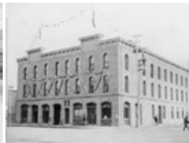
"View of Alberta Hotel, Calgary, Alberta., 1893, (CU1151254) by Unknown. Courtesy of Glenbow Library and Archives Collection, Libraries and Cultural Resources Digital Collections, University of Calgary. Decorated for Dominion Day? https://digitalcollections.ucalgary.ca/asset-management/2R3BF1F014Z6?WS=SearchResults .