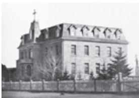
"Sacred Heart Convent, Calgary, Alberta," [ca. 1900-1905], (CU1156653)