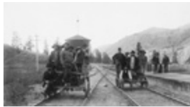
"Chinese section men on handcars, Canadian Pacific Railway., [ca. 1886], (CU1103679) by Boorne and May. Courtesy of Glenbow Library and Archives Collection, Libraries and Cultural Resources Digital Collections, University of Calgary. https://digitalcollections.ucalgary.ca/asset-management/2R3BF1O2D94D?WS=SearchResults .