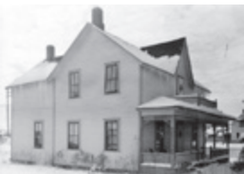
"First General Hospital in Calgary, Alberta," [ca. 1920], (CU1193643)