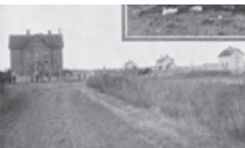
"St. Dunstan's Calgary Indian Industrial School, Calgary, Alberta," [ca. 1905], (CU11056821) by Unknown. Courtesy of Glenbow Library and Archives Collection, Libraries and Cultural Resources Digital Collections, University of Calgary. https://digitalcollections.ucalgary.ca/asset-management/2R3BF14A476V .