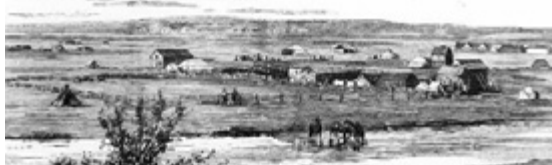
"Calgary, Alberta., 1884-11-08, (CU181590)

*All copyright images cannot be shared without prior permission.