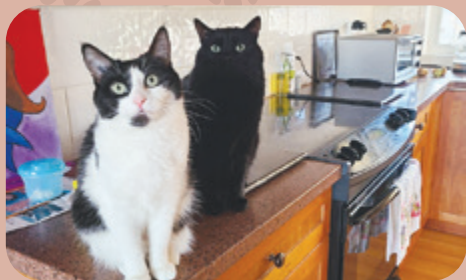
Meatball and Cleo, Renfrew