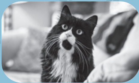
Tuxedo Joe, Cranston

To have your pet featured, email news@mycalgary.com