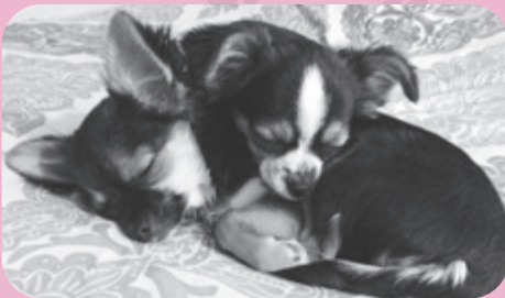
Tiger and Lily, Evanston

To have your pet featured, email news@mycalgary.com