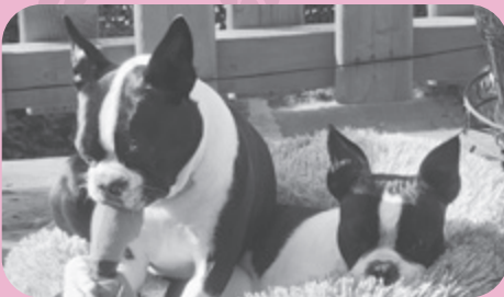
Thor and Loki, Shawnessy