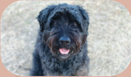
Bisous, Deer Run