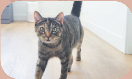
Nacho, Panorama Hills