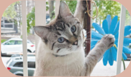
Chigs, Crescent Heights