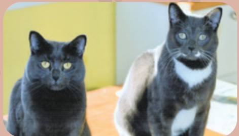
Sir Gawain and Sir Tristan, Woodbine

To have your pet featured, email news@mycalgary.com