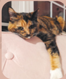
Millie, North Glenmore Park

To have your pet featured, email news@mycalgary.com