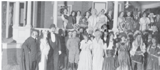
"Guests at Halloween party, Nimmons residence, Calgary, Alberta., 1910, (CU1100568) by Unknown. Courtesy of Glenbow Library and Archives Collection, Libraries and Cultural Resources Digital Collections, University of Calgary. https://digitalcollections.ucalgary.ca/asset-management/2R3BF10ZJEFT .