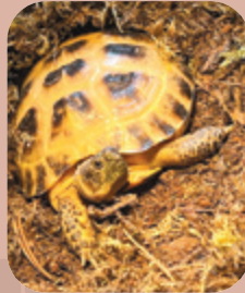
Dry Bones, McKenzie Lake