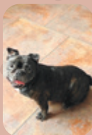
Molly, Elbow Scene