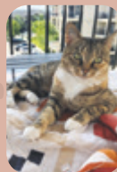
Willow, McKenzie Towne

To have your pet featured, email news@mycalgary.com