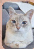
Tigger, Elbow Scene