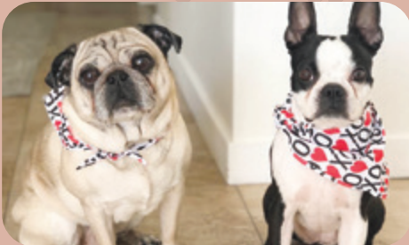
Talbot and Scout, Queensland

To have your pet featured, email news@mycalgary.com