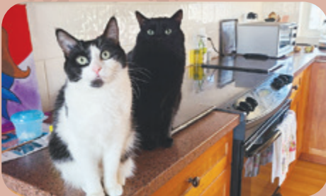
Meatball and Cleo, Renfrew