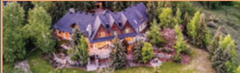
268 Snowberry Circle

67 transactions and 66 million sold in 2023