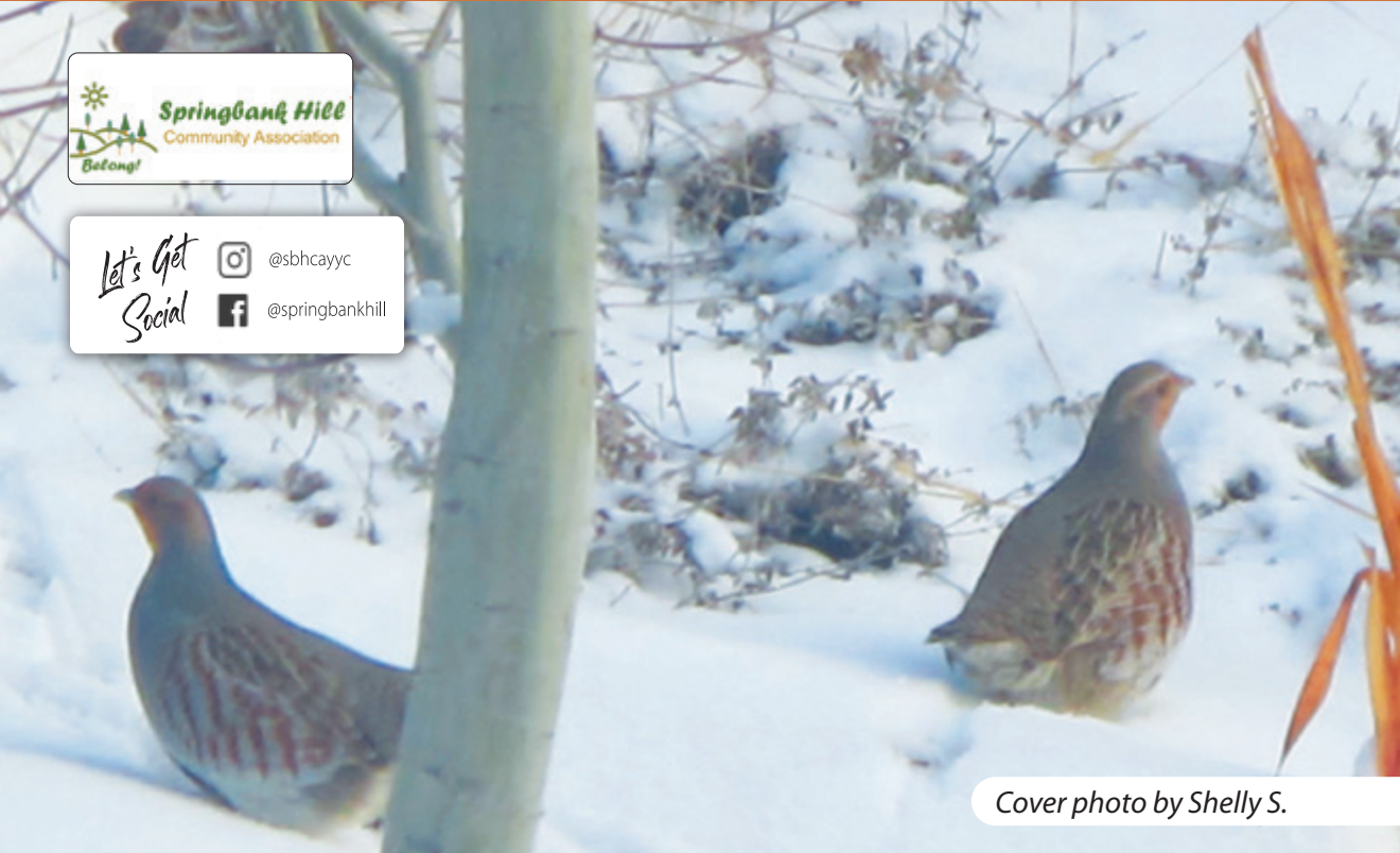
Cover photo by Shelly S.