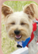
Louie, Country Hills