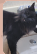
Sergeant Pepper, Thorncliffe