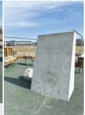
Wall pictured can be used for cat leaps, vaults, and wall climbs.