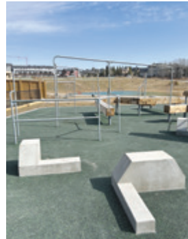
Bars and beams pictured can be used for bar swings and balance, blocks on the ground can be used for jumps and vaults.

To vault is a way to pass over objects between knee and chest height. Vaulting can be separated into lowline (when one hand or foot is always in contact with a surface) and highline (when there is no contact with the surface and you become briefly airborne).