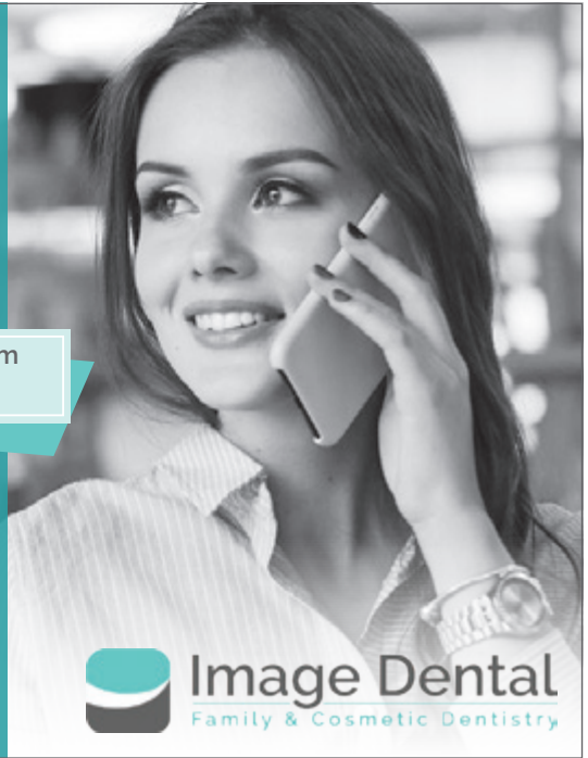
Image Dental Family & Cosmetic Dentistry