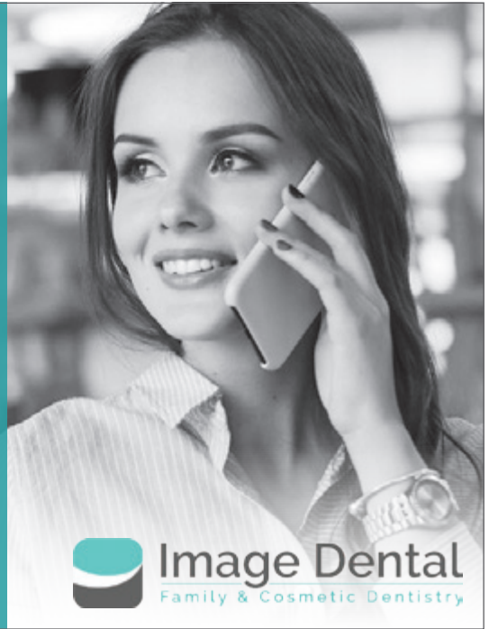
Image Dental Family & Cosmetic Dentistry

Services are provided by general dentists