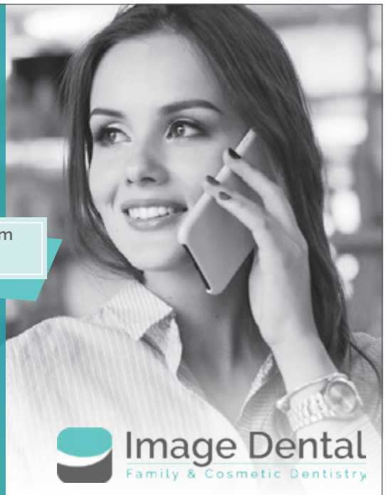
Image Dental Family & Cosmetic Dentistry