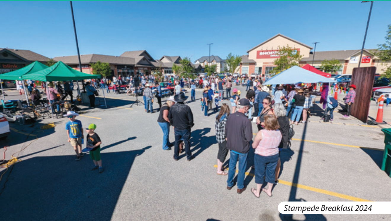
Stampede Breakfast 2024

BRINGING WEST SPRINGS, COUGAR RIDGE, & WENTWORTH TOGETHER