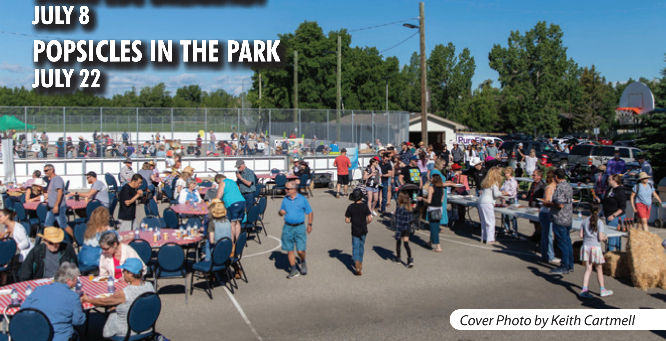
Cover Photo by Keith Cartmell